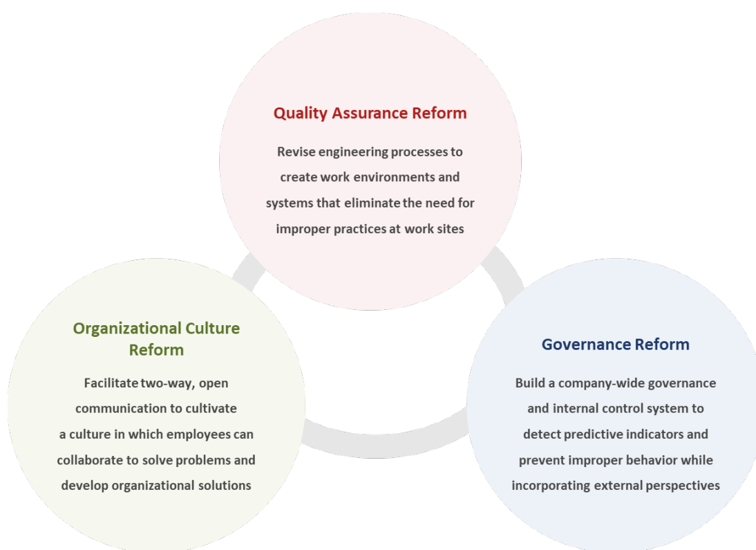
Overview of the Three Key Reforms

In collaboration with the company-wide transformation project, Mitsubishi Electric will make every effort to transform itself towards creating a new Mitsubishi Electric by enhancing and developing the Three Key Reforms of quality assurance, organizational culture, and governance.