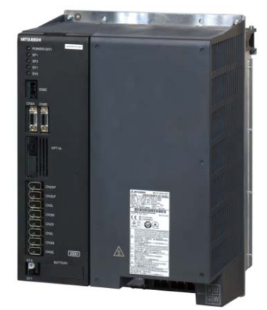
MDS-DM2-SPHV3-20080 multi-hybrid drive unit