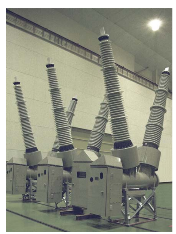
300kV gas circuit breaker

Mitsubishi Electric has produced switchgear for the last half-century. Since its first 84/72kV GCB in 1965, the company has steadily enhanced performance to meet growing high-voltage and large-current power infrastructure needs around the world.