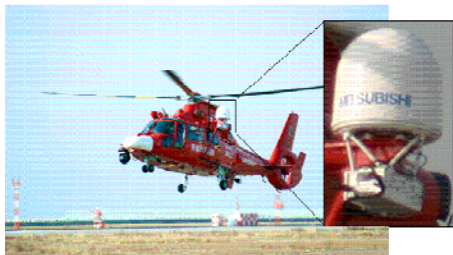
Enlarged image of HSA40 antenna