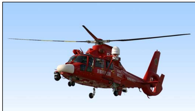
FDMA Helicopter with HSA40

Mitsubishi Electric's HSA40 helicopter satellite communication system transmits video and voice data from the helicopter to a satellite, enabling real-time information such as aerial video to be transmitted reliably to base stations from anywhere in Japan.