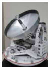
Antenna inside the radome