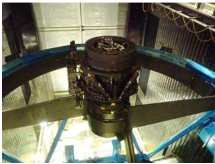
HSC installed in Subaru Telescope