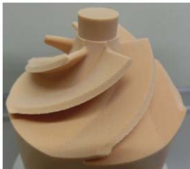
Item produced in test

TOKYO, February 17, 2015 – Mitsubishi Electric Corporation (TOKYO: 6503) announced today it has developed an advanced numerical-control method for compensating tool position error in predicted target tool paths. In five-axis machining tests, Mitsubishi Electric verified that the new method reduces machining time by 10.4% for improved productivity in machining complex geometries.