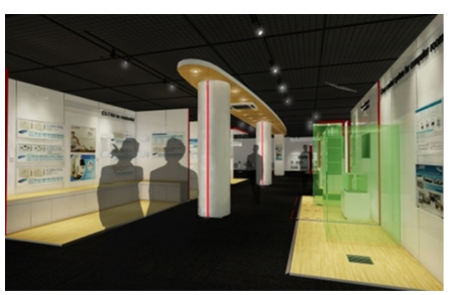
Rendition of AI Gallery

The AI Center, a five story building on a 7,700-square-meter property, includes four product-training rooms, a meeting space, and the Advance & Innovation Gallery (AI Gallery), which will enable visitors to experience demonstrations and trial operation of products in five categories; air conditioning systems, ventilation and air circulation, water and sanitation, lighting and renewable energy, and electrical home appliances.