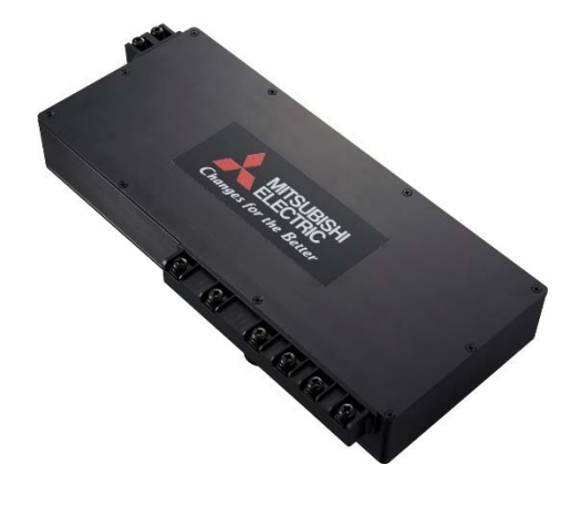
Super-compact power unit for HEVs (newly developed)