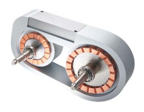
High-power-density electric machine for HEVs (newly developed)