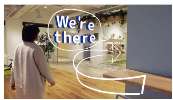
Arrow and bubble drawn on screen for more expressive message

Lines can be drawn in the video by tracing them on screen to supplement text with illustrations, such as arrows, pattern or cartoon-like decoration, to enhance the effect and clarity of the message.