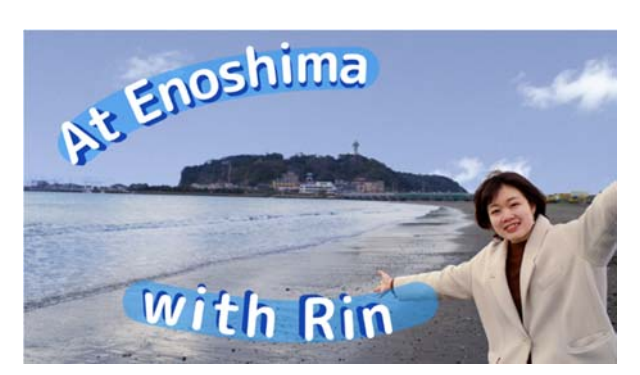
Screenshot of integrate video and audio text created with SwipeTalk Air app

Video recording and editing are seamlessly integrated, so the experience of capturing the moment live is never interrupted and users can enjoy inputting text intuitively.