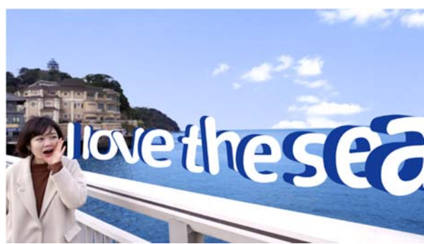
Subject speaks and cameraperson swipes finger (left) to instantly render 3D text in video (right)