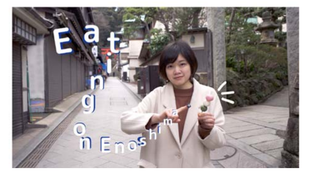
Positioning text using an AR marker (left: before, right: after)