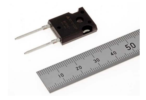
1200V SiC-SBD TO-247-2 package