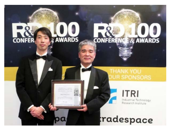
R&D 100 Awards ceremony participants

Electroplating is a process that puts the target item into contact with a plating solution via an electrode, without requiring a plating bath, enabling just the contact surface to be plated while sliding by the electrode.