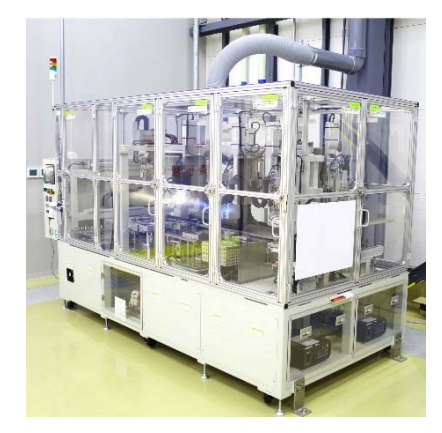
One-piece-flow automatic-sliding plating machine