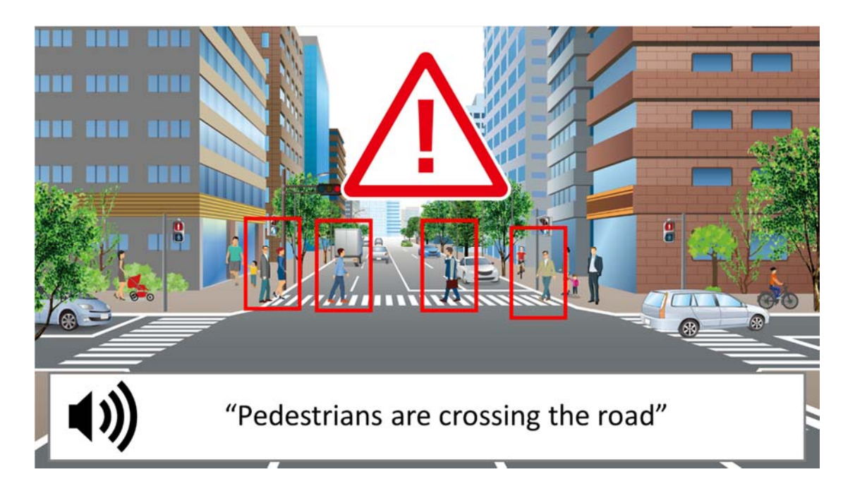
Example of Scene-Aware Interaction providing guidance to avoid hazards