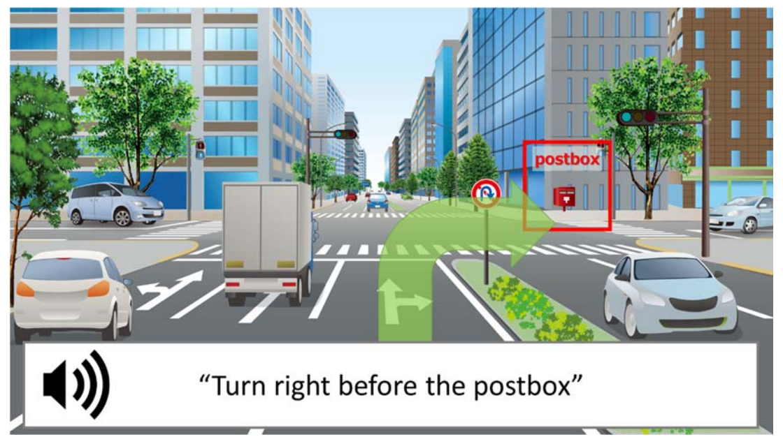
Example of Scene-Aware Interaction providing contextual guidance