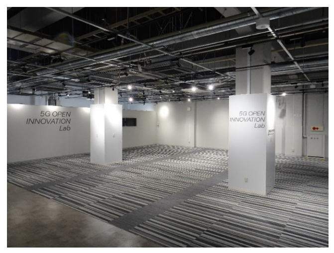
5G OPEN INNOVATION Lab

TOKYO, June 28, 2021 – <u>Mitsubishi Electric Corporation</u> (TOKYO: 6503) announced today that it will soon begin operating the 5G OPEN INNOVATION Lab<sup>TM</sup> to collaborate with customers and partner companies on research and test demonstrations of "local 5G" private mobile communication systems. The 132-square-meter facility, based in the company's Information Technology R&D Center in Kamakura, Kanagawa Prefecture, will open on June 30. Mitsubishi Electric was recently licensed by the Ministry of Internal Affairs and Communications (MIC) to operate local 5G mobile communication systems designed for private use by municipalities and companies in designated areas to meet specific needs.