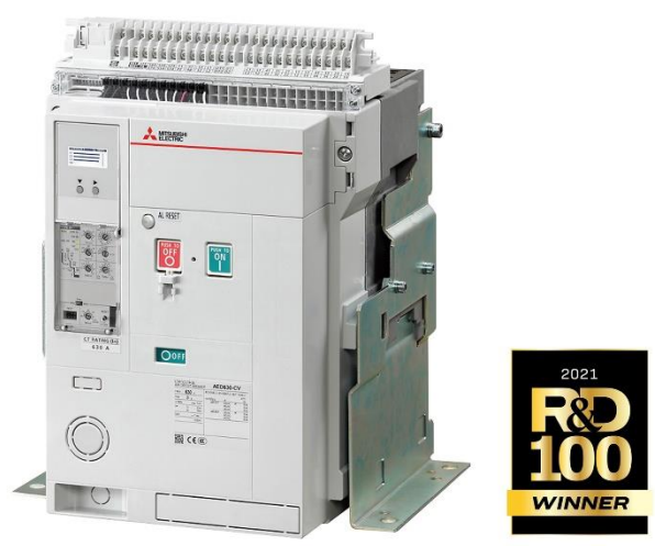
World Super AE V Series C-class low-voltage air circuit breaker

TOKYO, December 2, 2021 – <u>Mitsubishi Electric Corporation</u> (TOKYO: 6503) announced today that it has received a 2021 R&D 100 Award from the U.S. publication R&D World for its low-voltage air circuit breaker(World Super AE V Series C-class), a switching device that protects low-voltage power-distribution systems in factories and buildings. Including this year's award, Mitsubishi Electric has now won 27 R&D 100 Awards.