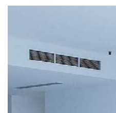
The living room vent of an indoor unit for a condominium

energy efficiency, thanks to Mitsubishi Electric's advanced inverter technology. Where quality of life is the primary concern, Mitsubishi Electric is the cool favorite.