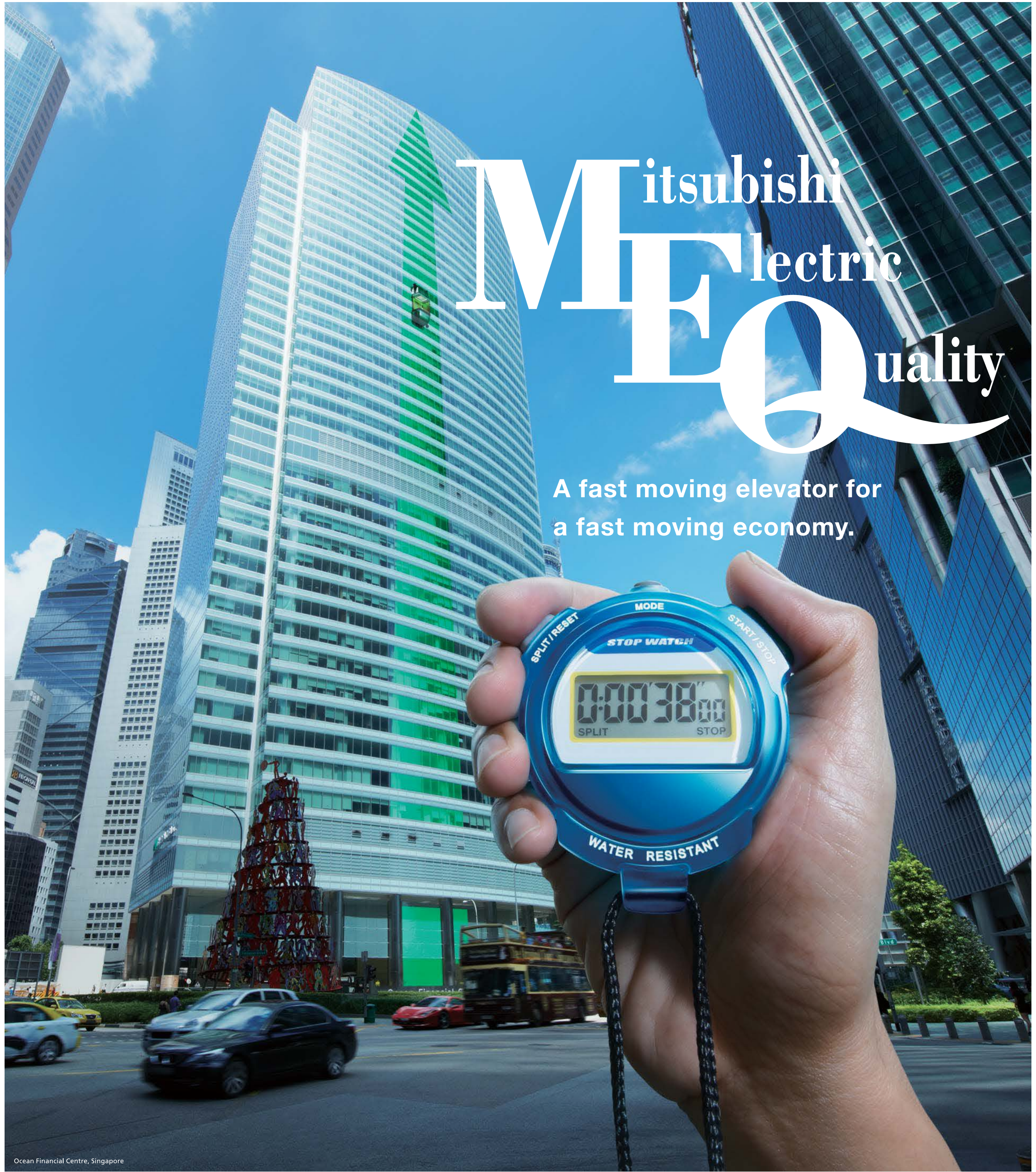
Ocean Financial Centre, Singapore