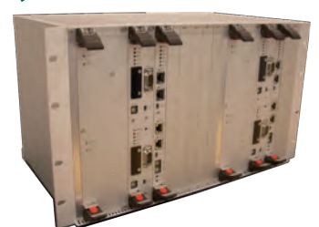
Vital unit for wayside

Easy to install by adopting 2.4-GHz-band radio, which does not require a radio license