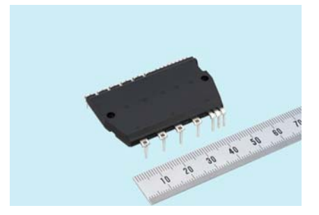
New Mini DIPIPM (5A-15A)

Motor drive inverter systems have been evolving rapidly in recent years in response to increasing demands for energy savings. Mitsubishi Electric's new 5A–50A industrial Mini DIPIPM series uses sixth-generation IGBT chips featuring the carrier-stored trench-gate bipolar transistor (CSTBT<sup>TM</sup>) structure, a special feature of Mitsubishi Electric IGBT chips, as well as integrated external components such as BSD, current-limiting resistors and thermistors, to reduce the power consumption, size and cost of small-capacity inverter systems.