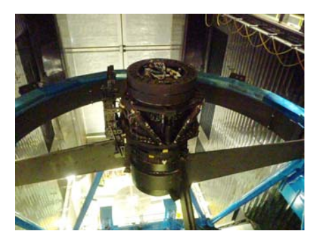
HSC installed in Subaru Telescope