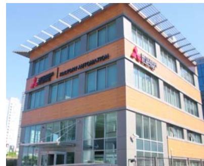
New Turkey FA Center, Ümraniye office

Mitsubishi Electric started its FA business in Turkey in June 2013 with five locations and 42 employees. FA product support has been provided up to now through local distributors and the Europe FA Center in Poland. The establishment of this new domestic center is expected to realize significantly faster and stronger FA product services throughout the country.