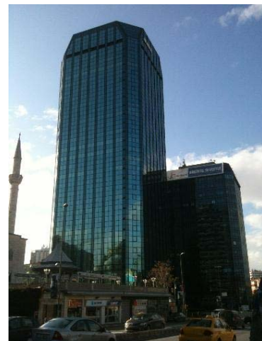
Maya Akar Center, location of Mitsubishi Electric Turkey HQ