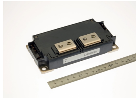
CM1400HA-24S / RM1400HA-24S CM1000HA-34S / CM500C2Y-24S