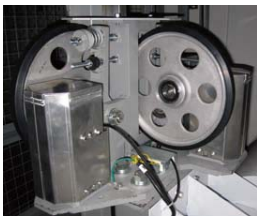
Active Roller Guide

Horizontal vibration due to slight rail warp or wind pressure is reduced effectively.