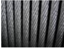
Traction Wire Rope

Traction wire rope featuring a new structure, developed by Mitsubishi Electric, offers more strength than conventional steel wire rope of the same mass.