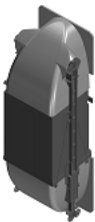
Streamlined Car Fairings

Streamlined fairings reduce noise generated by air flow around cars.