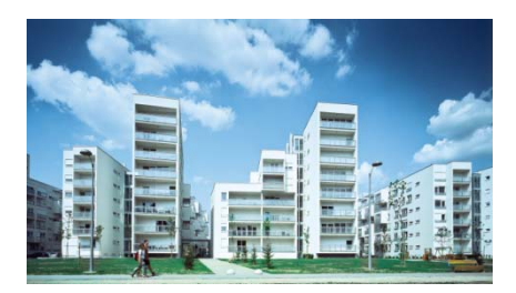
Typical low- to mid-rise residential buildings

The new NEXIEZ-S is targeted at low-rise residential and office buildings of up to 10 stories, which account for a large part of the mid-range market in the Middle East and Europe. The lineup features elevators that do not require a rooftop machine room to meet the structural requirements of many low-rise buildings. NEXIEZ-S elevators offer a full complement of basic functions and safety features, as well as comfort and performance, based on the NEXIEZ platform design. NEXIEZ-S elevators also offer space and energy savings. The name NEXIEZ-S is a combination of "next generation," "axis" and "simple design."