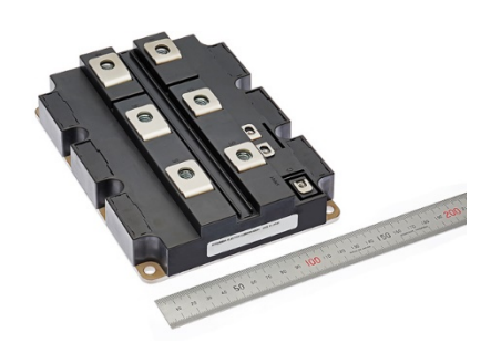
X-Series HVIGBT module

TOKYO, April 5, 2017 – Mitsubishi Electric Corporation (TOKYO: 6503) announced today that it has developed eight new X-Series HVIGBT modules in three (3.3kV, 4.5kV and 6.5kV) classes for larger capacity and smaller sized inverters in traction motors, DC-power transmitters, large industrial machinery and other high-voltage, large-current equipment. The models will be released sequentially beginning in September. Prior to the releases, the models will be exhibited at several major trade shows worldwide, including MOTORTECH JAPAN 2017 during in Chiba, Japan from April 19 to 21, Power Conversion and Intelligent Motion (PCIM) Europe 2017 in Nuremberg, Germany from May 16 to 18, and PCIM Asia 2017 in Shanghai, China from June 27 to 29.