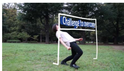
Image from a video taken with the app

It will contribute to accomplish a new video expression by placing letters in anywhere of virtual midair in the screen. As the arranged text will look fixed in place, even when changing the camera angle, taking videos that combine such text and recorded objects enables new ways of expressing oneself and new uses based on users' ideas. Due to swift text positioning, user can easily produce videos full of creativity.