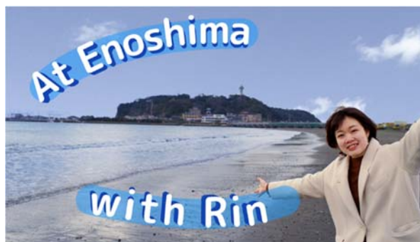
Screenshot of integrate video and audio text created with SwipeTalk Air app

Video recording and editing are seamlessly integrated, so the experience of capturing the moment live is never interrupted and users can enjoy inputting text intuitively.