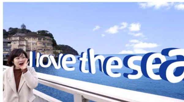
Subject speaks and cameraperson swipes finger (left) to instantly render 3D text in video (right)