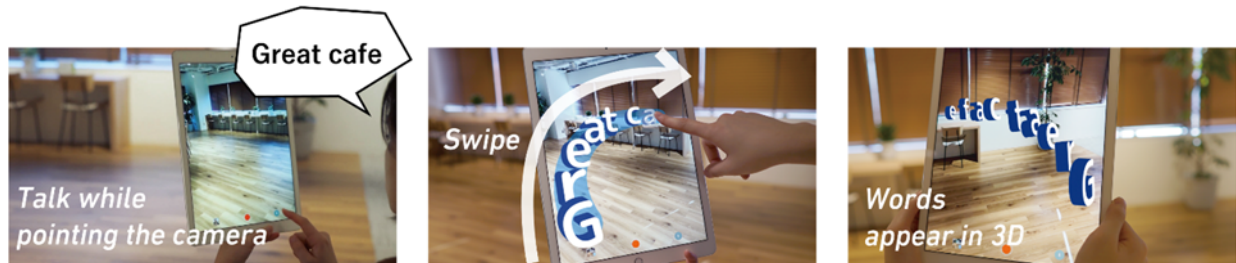
Steps for using SwipeTalk Air UI

The UI immediately renders spoken words as 3D text in a video as the cameraperson swipes a finger across the device screen. The device is pointed at the subject, a few words are spoken, a line is swiped on the screen and then the text instantly appears in the swiped area.