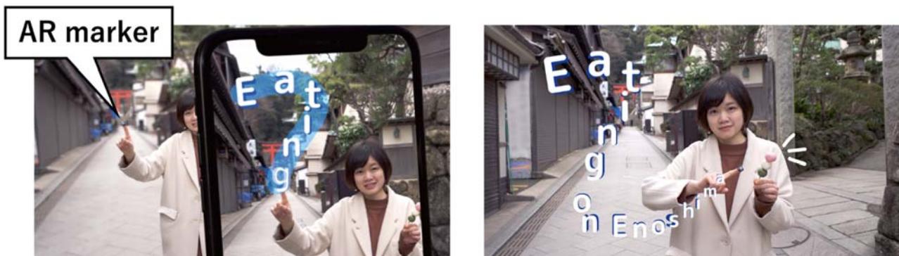
Positioning text using an AR marker (left: before, right: after)