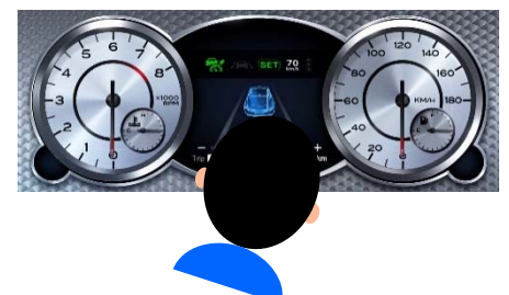
Gloss and shading change in real time according to viewing angle