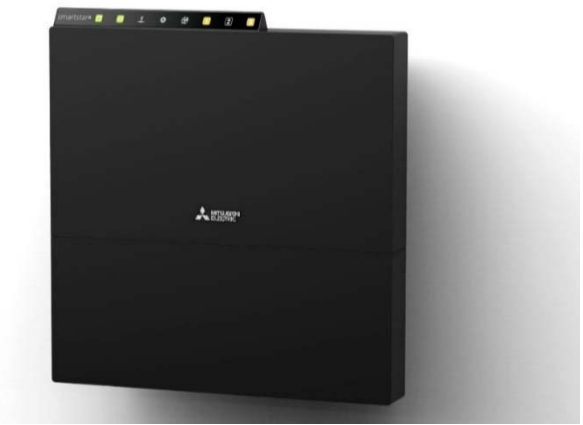
Mitsubishi Communication Gateway XS-5R/XS-5T environment-resistant IoT communication gateway

Three other Mitsubishi Electric products also won international Product Design 2018 awards: the MSZ-AP series room air conditioner, the MLZ-KP/MLZ-RX/MLZ-GX/MLZ-HX unidirectional ceiling-mounted cassette-type air conditioner series, and the Ecodan PUHZ-AA series air-to-water heat pump outdoor unit.