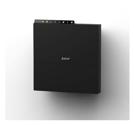
Rendering 1: wall-mounted installation