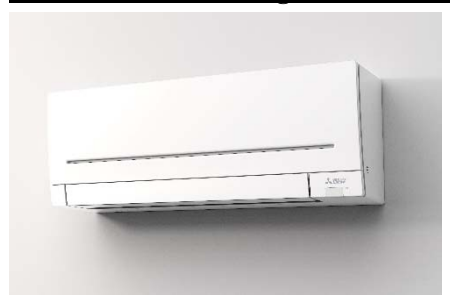
MSZ-AP series room air conditioner