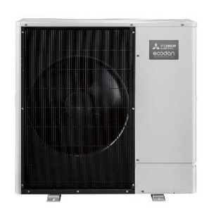
Ecodan PUHZ-AA series air-to-water heat pump outdoor unit