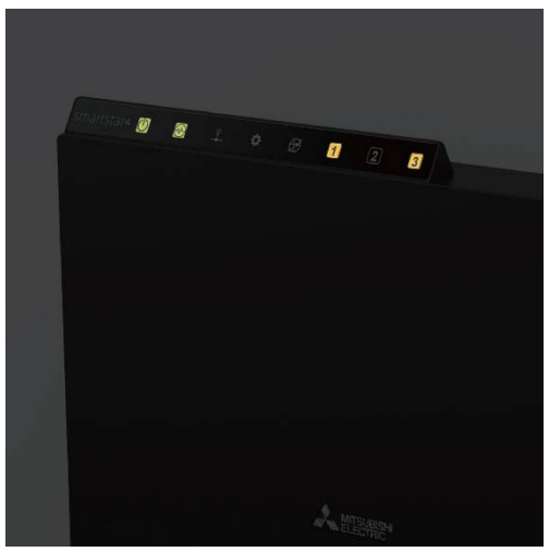
Rendering 4: Backlit pictogram display