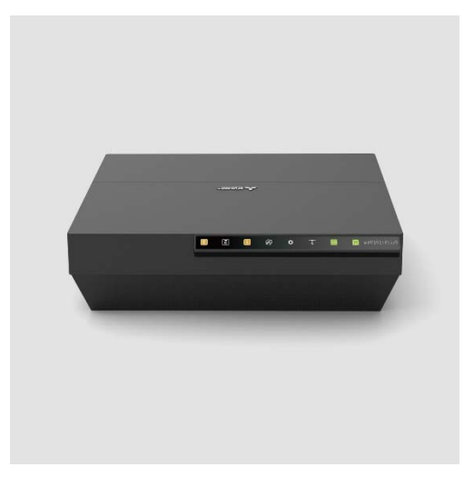
Rendering 3: horizontal mounting on a rack