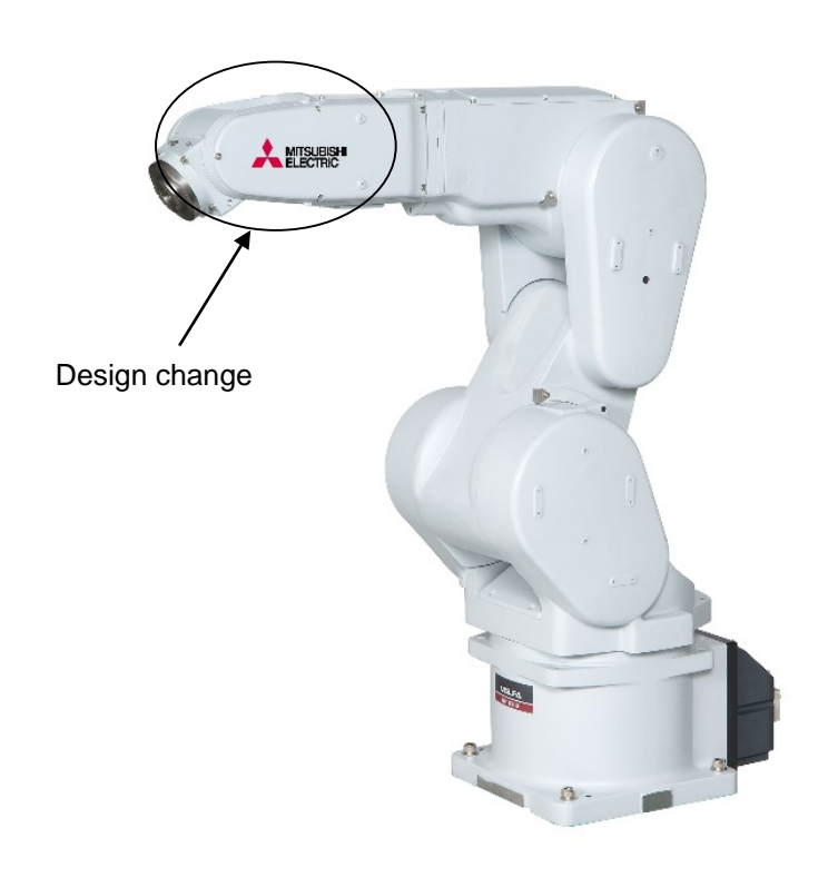
Figure 1 Details of the design change

Please refer to the next page about details of the change contents.