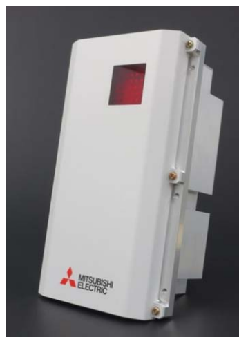
28GHz massive-element antenna and RF module for 5G base stations (120×240×28mm)

*Forum for discussing 5G wireless technologies organized by NOKIA and NYU WIRELESS, a research center, at NYU Tandon School of Engineering