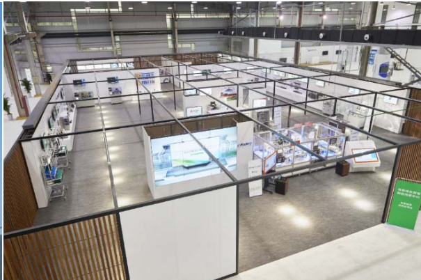
e-F@ctory demonstration zone

Mitsubishi Electric established an FA components production facility, Mitsubishi Electric Automation Manufacturing (Changshu) Co., Ltd., in Changshu city in 2011. It then concluded a strategic partnership agreement with Changshu city in 2016 to support the establishment of the e-F@ctory demonstration zone, the largest zone among exhibiting companies at the center. Demonstrations cover a wide variety of topics, including e-F@ctory solutions, devices for energy savings in factories and office buildings, energy-monitoring systems and solutions developed with e-F@ctory Alliance partners.