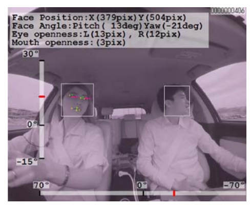
Flexible installation of camera position