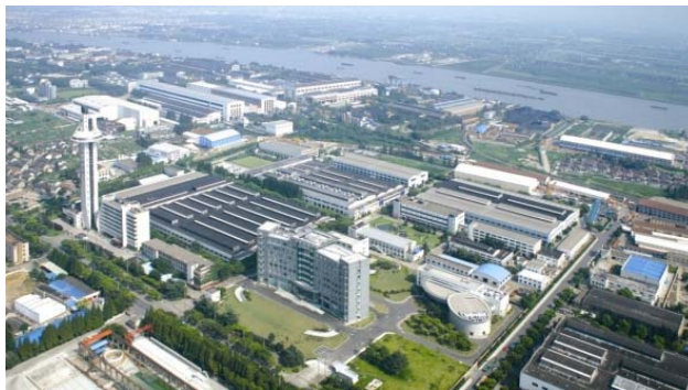
SMEC production plant

TOKYO, October 16, 2014 – Mitsubishi Electric Corporation (TOKYO: 6503) announced today that Shanghai Mitsubishi Elevator Co., Ltd. (SMEC), an elevator and escalator joint-venture company with Shanghai Electric Group Company Limited in Shanghai, China, surpassed cumulative production of 500,000 units earlier this month.