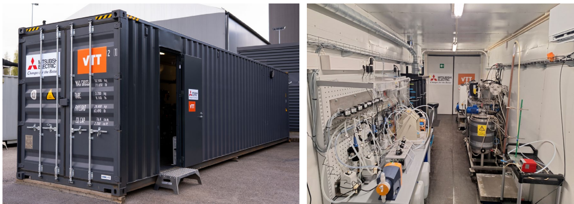
Lab-scale pilot facility for DOC

System uses gas-capture method and will accelerate societal implementation by integrating with existing infrastructure