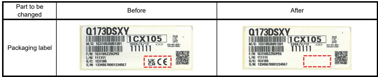
Table 2. Changes in the packaging label