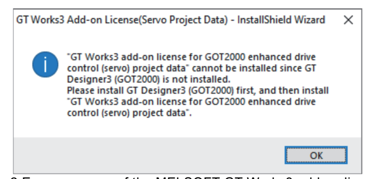
Fig 2 Error message of the MELSOFT GT Works3 add-on license (for GOT2000 enhanced drive control (servo) project data)