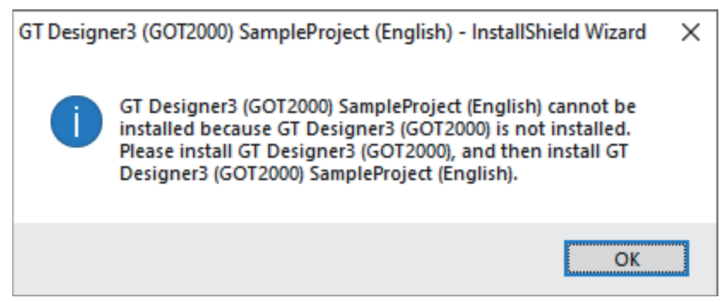
Fig 1 Error message of the sample projects (for GT Designer3 (GOT2000))