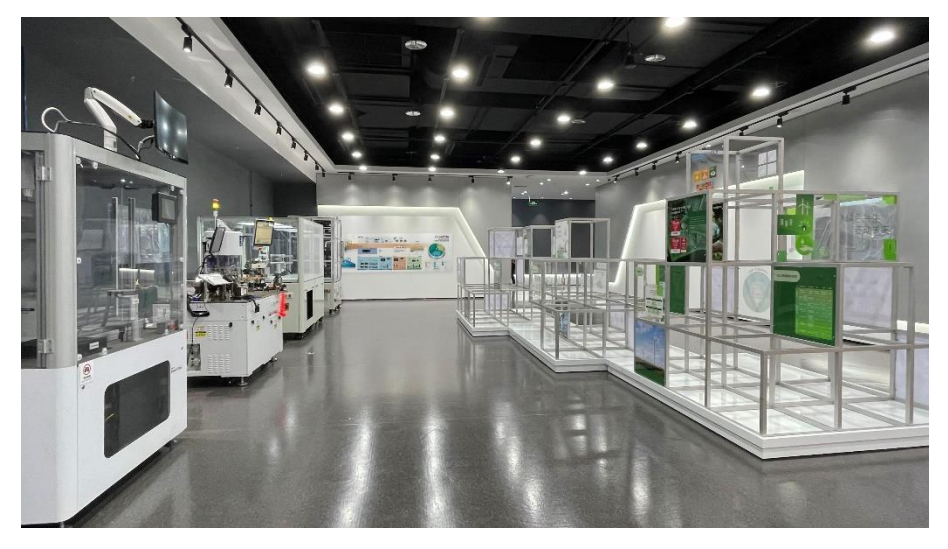
The Mitsubishi Electric Intelligent Manufacturing Technology Innovation Center (Shenzhen) is a multi-purpose facility centered around a showroom featuring the latest products, technologies and solutions in automation.

The Shenzhen FA Center, located in the same building as the Mitsubishi Electric Intelligent Manufacturing Technology Innovation Center (Shenzhen), will provide technical service and support in Chinese, English and Japanese for customers in the South China region. The FA Center will also host training courses to help customers learn necessary skills and knowledge in automation, which will be supported by live demonstrations