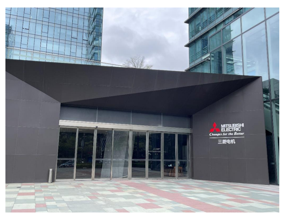
Mitsubishi Electric Intelligent Manufacturing Technology Innovation Center and FA Center in Shenzhen will provide visitors with first-hand experience in innovative technologies in factory automation.

Mitsubishi Electric has established a new FA Center and showroom next to the Shenzhen Branch of its subsidiary Mitsubishi Electric Automation (China) Ltd. The new facility, which is scheduled to open on December 27 in Shenzhen, China, will strengthen servicing and support for Mitsubishi Electric factory automation (FA) products in the South China region and provide visitors with first-hand experience in innovative technologies around FA devices, computerized numerical controllers (CNCs) and machine tools.