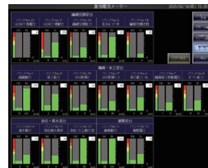
# Visualization screen using SoftGOT The Yanase Factory is using SoftGOT to achieve minute-by-minute visualization.

Additionally, individual factories are developing their own enhancements, such as the Yanase Factory in Asago (Hyogo Prefecture), which has introduced preventive maintenance measures by using SoftGOT to monitor wiring insulation in real time.