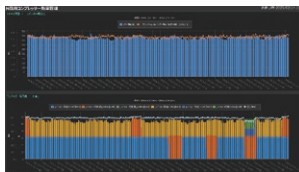
EcoAdviser displays energy information clearly as graphs and charts.