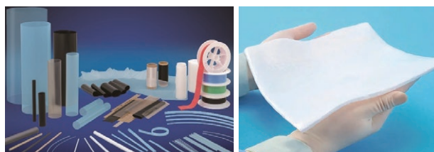
As well as innerwear, Gunze produces engineering plastics, medical materials, and more. Left: Seamless belts made from engineering plastics, suitable for a variety of uses. Right: An example of artificial skin composed of two layers; a collagen sponge and a silicone film.

Originally established as an innerwear manufacturer, Gunze has since expanded into other industries, including plastic films for beverage packaging, engineering plastics for printers and photocopiers, and medical materials such as artificial skin. These products are primarily manufactured at the company's domestic and overseas factories or through affiliated businesses.