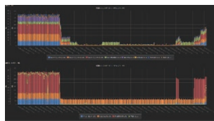
Fukushima Plastics Co., Ltd.: power consumption comparison screen for the production facility