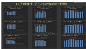
Centralized demand management screen