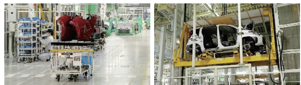
Various equipment is used in the logistics warehouse. Gemini allows the whole process to be visualized.

This broader perspective helped the team spot inefficiencies in areas such as lift transporters and flow lines, leading to quicker and more effective problem-solving.