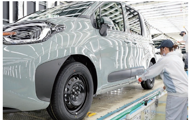
On-site operators are now able to suggest and implement improvements themselves, using 3D visualization as a shared reference point.