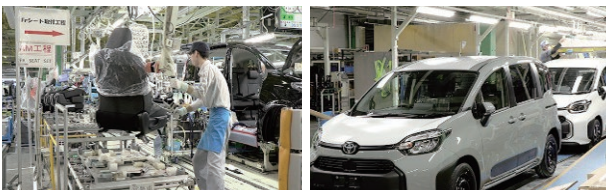
Toyota Motor East Japan is responsible for the whole production process for compact cars, from planning and development to manufacturing.

Looking for a more effective tool, Toyota Motor East Japan found Mitsubishi Electric's MELSOFT Gemini simulator. This 3D simulation platform enables teams to visualize equipment layouts and operation timings in a virtual environment before actual hardware is installed.