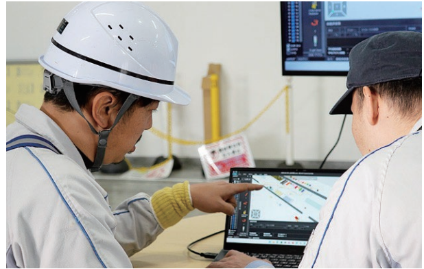
On-site operators are now able to suggest and implement improvements themselves, using 3D visualization as a shared reference point.

Compared to 2D drawings, 3D models are easier for all staff to understand and assess. According to Kamio, the new system has helped create "an environment where issues can be shared and everyone can contribute ideas for improvement."