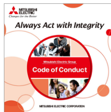
Mitsubishi Electric Group Code of Conduct