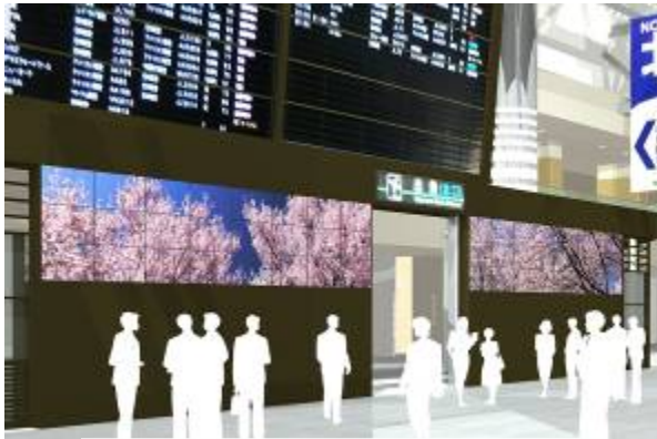
Rendition of large LCD display wall

Tokyo, September 29, 2011 – Mitsubishi Electric Corporation (TOKYO: 6503) announced today that it has received an order for Japan's largest digital signage system from Narita International Airport, comprising a total of 340 display units including two pairs of 330-inch screens, an unprecedented concave organic light-emitting display (OLED) screen and multiple touch-screen displays. Partial operation is scheduled to begin in March 2012 and full operation by that summer.