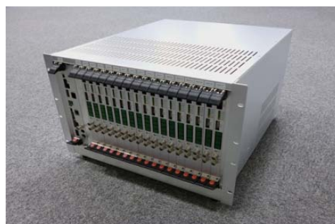
Fig. 2 HEVC encoder (w 431 x d 496 x h 312 mm)