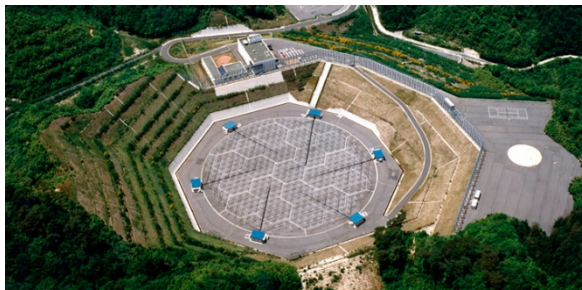
Aerial view of MU radar