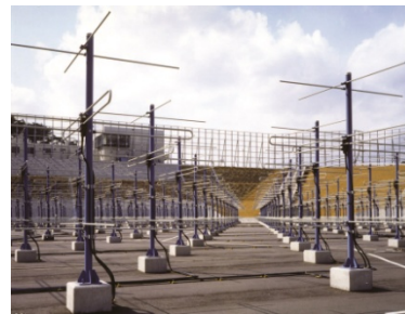
Antenna area of MU radar