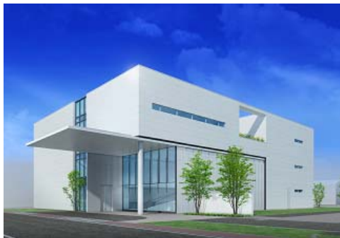
Rendering of new training center

TOKYO, June 17, 2015 – Mitsubishi Electric Corporation (TOKYO: 6503) announced today that it will build a new training center in Japan to strengthen human resources development as the company further globalizes the sales, manufacturing, installation and maintenance functions of its building-systems business, including elevators and escalators. The center, which is scheduled to start operating in April 2016, will be located on the premises of the Inazawa Works, the center of Mitsubishi Electric's building-systems development and manufacturing activities.