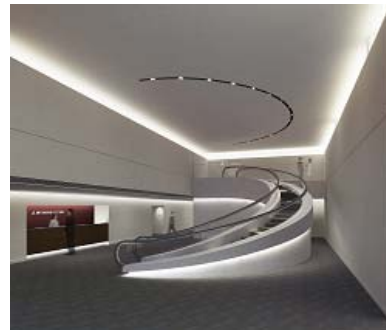
Rendering of new training center entrance

The center will have several training rooms equipped with advanced IT systems for diverse training purposes. It will be used by personnel from throughout Mitsubishi Electric and its affiliates, including in Japan and abroad, from new hires to mid-career employees. Training will be provided for all operational processes, including marketing, engineering, manufacturing, installation and maintenance. Training for top executives will also be carried out.