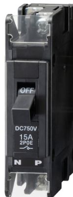
No-fuse Switch for HVDC KB-HDA

The awards ceremony took place at Las Vegas, Nevada, U.S. on November 13.