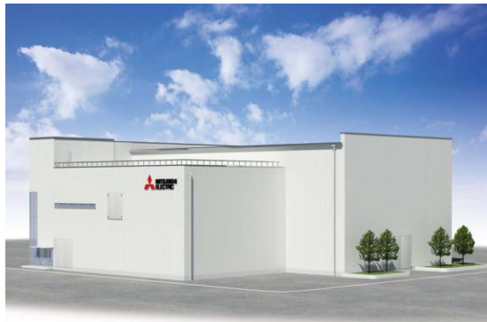
Rendition of Mitsubishi Electric's HVDC Verification Facility

TOKYO, October 12, 2016 – Mitsubishi Electric Corporation (TOKYO: 6503) announced today that it will enter the global market for voltage-sourced converters (VSC) based high-voltage direct current (HVDC) systems with a new HVDC verification facility to be built at its Transmission and Distribution Center in Amagasaki, Japan by 2018. The company is targeting more than US$ 500 million in global orders for HVDC -Diamond ® systems by 2020.