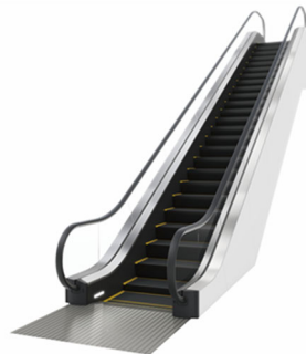
Mitsubishi u series escalator

TOKYO, December 7, 2020 – Mitsubishi Electric Corporation (TOKYO: 6503) announced today the immediate commercial launch of its new u series of escalators, which enhance passenger safety and comfort and also achieve significant energy savings compared to previous models. The company is targeting annual sales of 500 units in the ASEAN, Middle Eastern, Latin American and Indian markets.