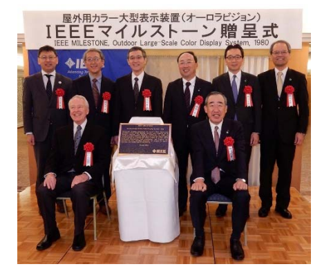
Presentation Ceremony at Hotel New Nagasaki on March 8, 2018

Up to 1980, electric scoreboards at stadiums conventionally only used incandescent lamps to project just letters and numbers. In response to growing demand for screens that could project images as beautiful as TV images at distances of up to 100 meters, Mitsubishi Electric successfully developed a three-color (red, blue and green) compact cathode ray tube (CRT) capable of displaying brilliant full-color video even in sunlight. Also, the company's new software could be used to control images, music and other content, providing a tremendous boost to in-game entertainment at stadiums.