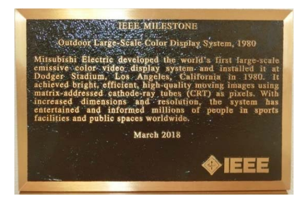
IEEE Milestone commemorative plaque

TOKYO, March 8, 2018 – <u>Mitsubishi Electric Corporation</u> (TOKYO: 6503) announced today that the company's Diamond Vision<sup>TM</sup> series of outdoor large-scale color display systems has received the prestigious IEEE Milestone award from the Institute of Electrical and Electronics Engineers (IEEE). Diamond Vision is Mitsubishi Electric's series of proprietary displays, of which more than 2,000 have been installed globally since the first unit was introduced at Dodger Stadium in Los Angeles, USA in 1980. The award recognizes the prominent role and high esteem of Diamond Vision as the world's first outdoor large-scale color display systems for creating impressive video images.