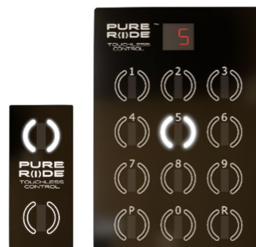
Touchless hall button and car operating panel

The PureRide™ touchless design (applicable for new and existing elevators) allows users to request elevators and designate destinations simply by placing a hand or finger over a sensor. An LED “halo” focuses the sensor’s target while providing the user with intuitive feedback. Responding to the growing needs for hygiene, the sophisticated PureRide™ solution further enhances user experiences.