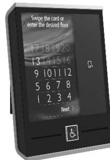
Touchless hall operating panel