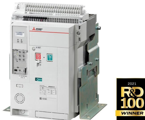
World Super AE V Series C-class low-voltage air circuit breaker

TOKYO, December 2, 2021 – Mitsubishi Electric Corporation (TOKYO: 6503) announced today that it has received a 2021 R&D 100 Award from the U.S. publication R&D World for its low-voltage air circuit breaker(World Super AE V Series C-class), a switching device that protects low-voltage power-distribution systems in factories and buildings. Including this year's award, Mitsubishi Electric has now won 27 R&D 100 Awards.