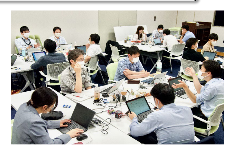
Meeting on measures of communication