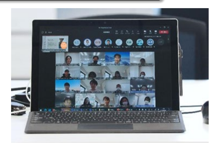
Round table discussion by working parents