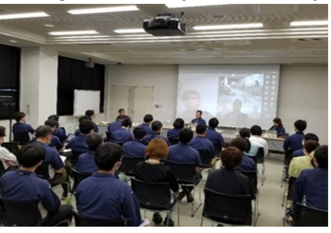
Transformation projects within each business division and affiliates